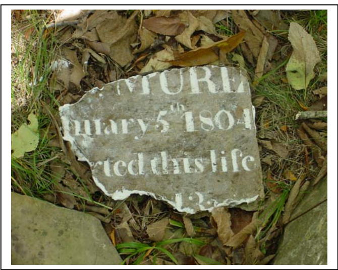
These two pieces go together. IN