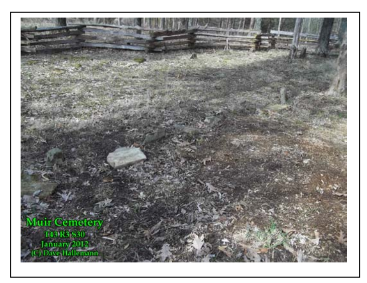
The above picture show the cleaned up inside with the wonderful new split rail fence.